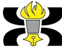
Amazigh Cultural Association In America