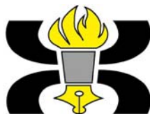
Amazigh Cultural Association In America