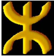
Tazzla Institute for Cultural Diversity