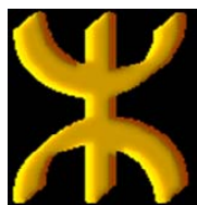
Tazzla Institute for Cultural Diversity